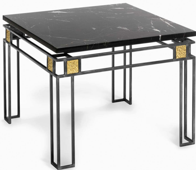
COFFEE TABLE (13629) W 60 cm x D 60 cm x H 45 cm – 20 kg Brass leaf and patina