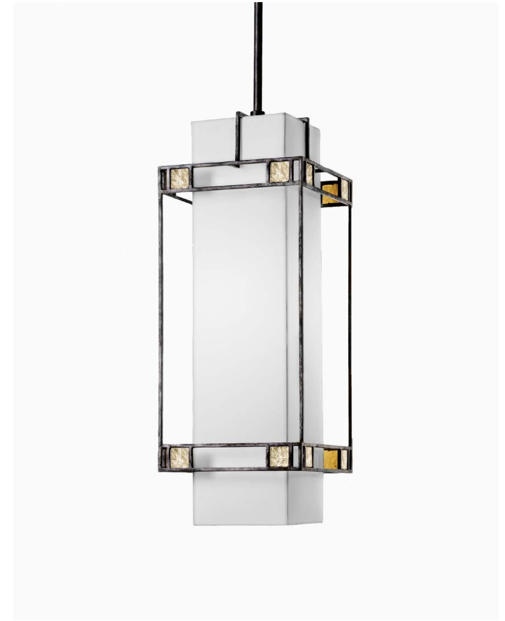
CEILING LIGHT (13636) W 110 cm x D 30 cm x H 70 cm – 15 kg Brass leaf and patina