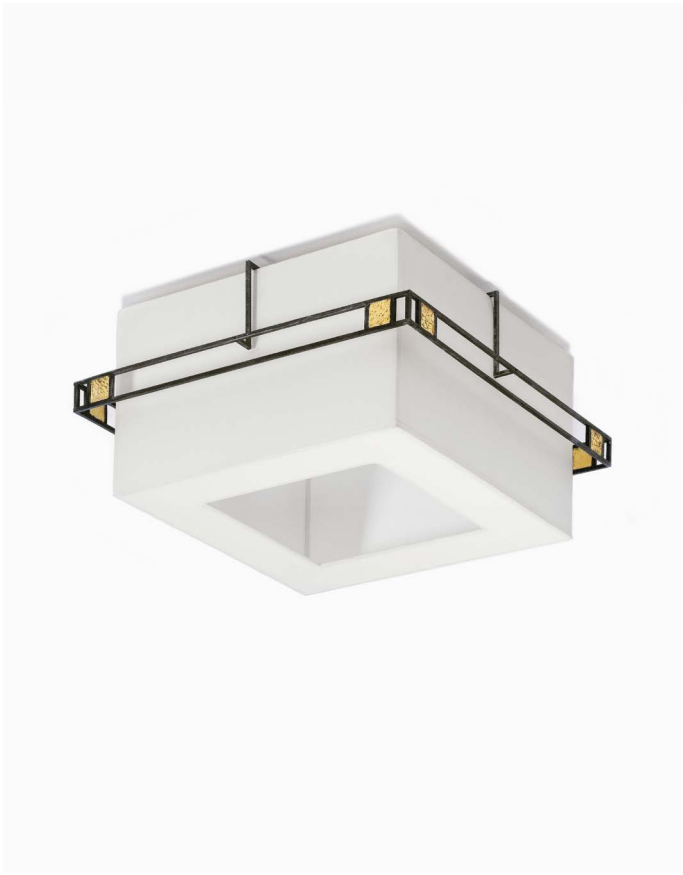
FLUSHMOUNT (13631) W 30 cm x D 30 cm x H 20 cm – 5 kg Brass leaf and patina