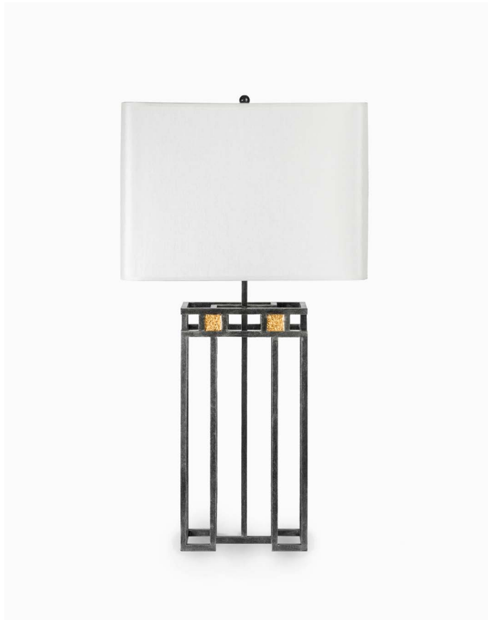
LAMP (13861) W 37 cm x D 27 cm x H 73 cm – 5,5 kg Brass leaf and patina