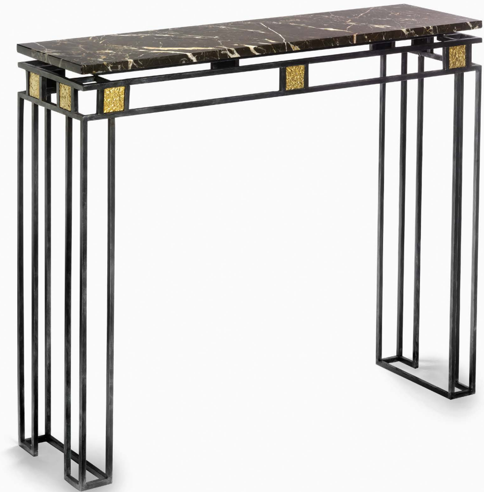
CONSOLE (13630) W 110 cm x D 30 cm x H 88 cm – 38 kg Brass leaf and patina